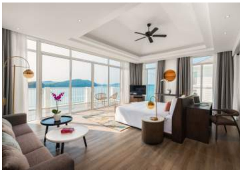
On the Rock Villa